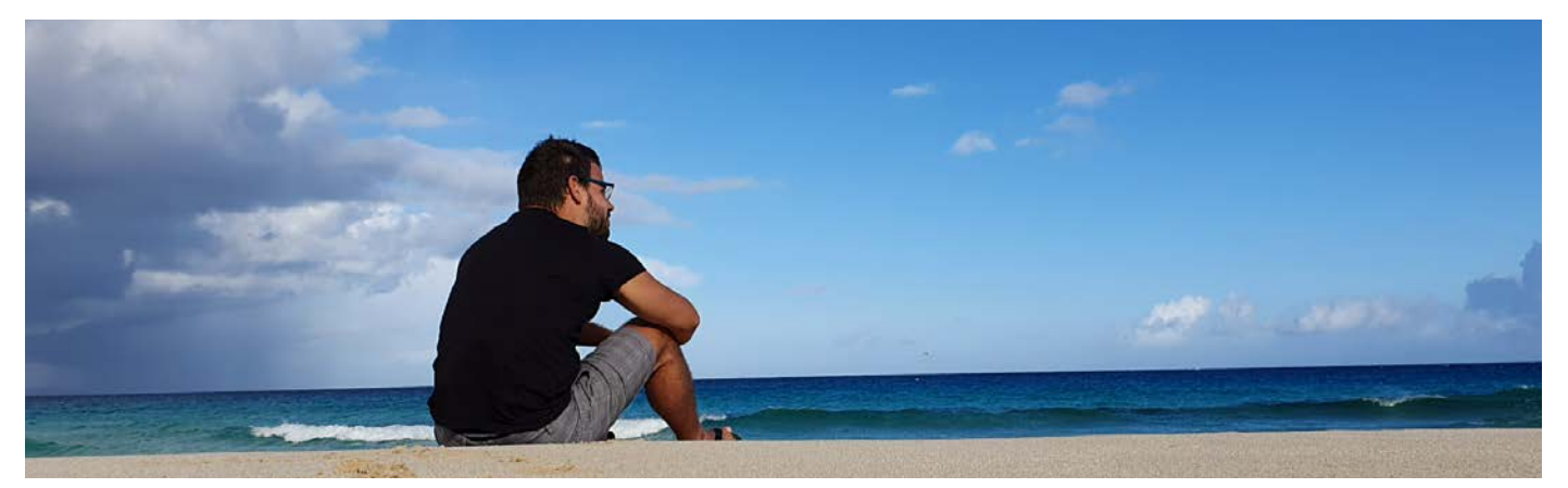
"A small film that couldn't be bigger."